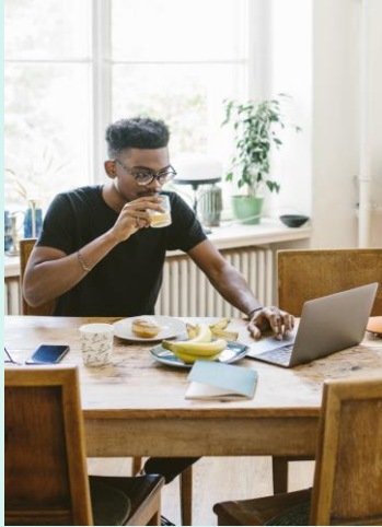
Work from home